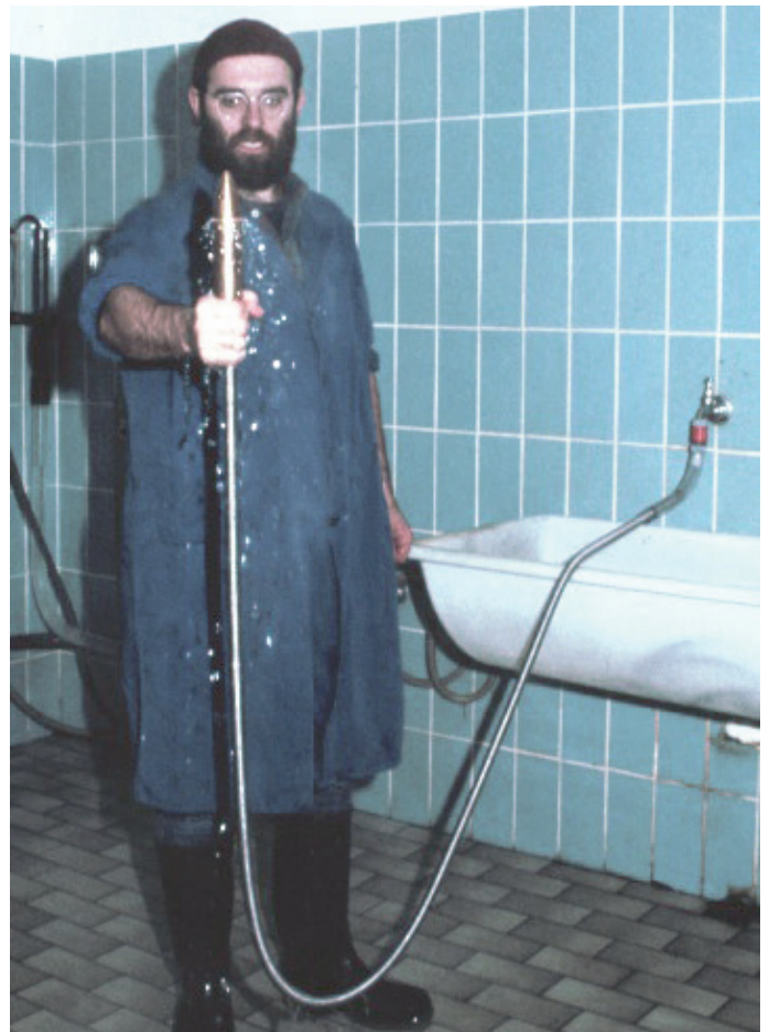
Figure 5. Cleaning of the probe by connecting it to a water tap

Saliva contamination due to introduction of the probe was not detected in the samples since no differ-