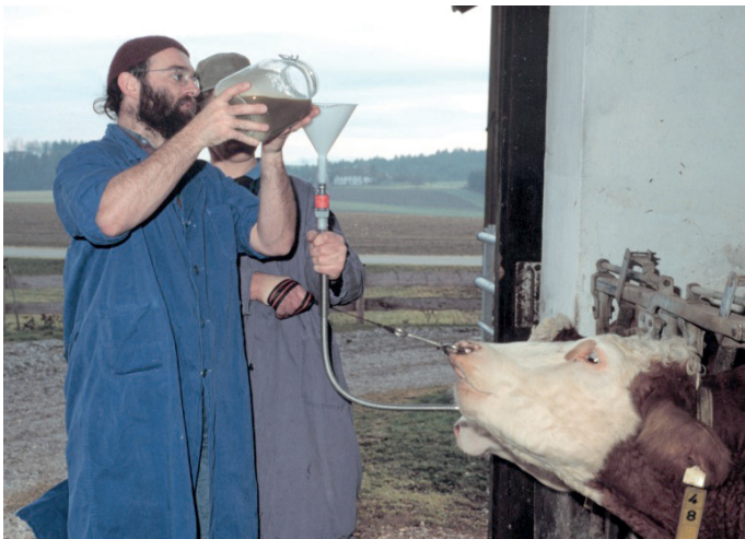
Figure 4. Transfer of ruminal fluid using the oro-ruminal probe and the funnel