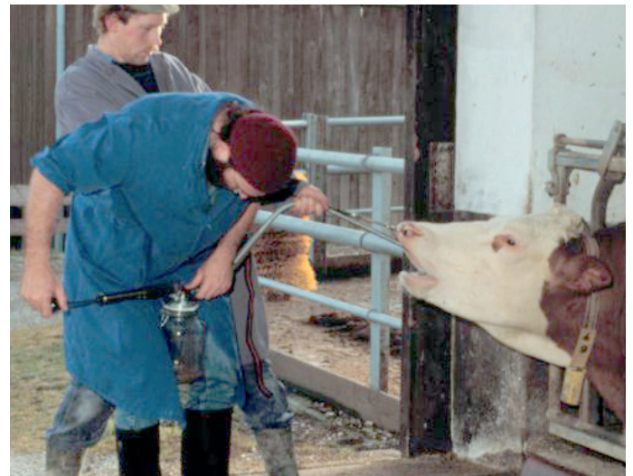
Figure 3. Collection of ruminal fluid using the oro-ruminal probe and the suction pump

2. The introduction of the probe took an average time of 40 seconds. Within 2 minutes an average amount of 1.2l ruminal fluid was siphoned off ("spontaneous efflux"). In every case 2l of ruminal fluid were obtainable using the suction pump. The suction tube never got plugged. Few holes of the suction head obstructed (average number: 7) but this did not hamper the collection. The administration of 2l of ruminal fluid or water was