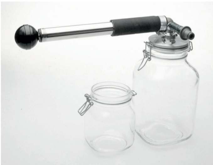
Figure 2. Suction pump with the 3l fluid container connected. 1l container

in the probe's head during collection of 2l ruminal contents. The time required to administer 2l of ruminal fluid that had been collected by this probe, and for administration of 2l water via funnel and probe (15 administrations each) were also recorded.